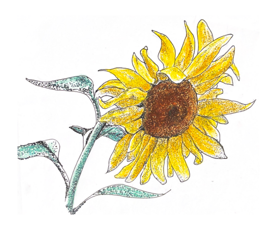
Artwork by Catherine Kingsbury

Luther Burbank Home & Gardens has planted hundreds of sunflowers in celebration of the Spring Equinox on March 20th! The sunflower is the national flower of Ukraine.